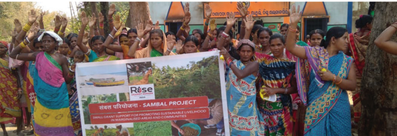
Women farmers at the launch of SAMBAL initiative, Odisha, March 08, 2020

Rise Against Hunger India bolsters agricultural production and incomes through programs promoting improved agricultural methods, business skills and market access. With training and access to quality seeds & fertilizers and through the provision of farming machines, the produce can be increased and farmers can harvest a variety of nutritious crops. By supporting livestock production, we provide pathways to diversify diets and improve nutritional outcomes. Through income generating activities, we help individuals increase their earning potential and their consistent access to food.